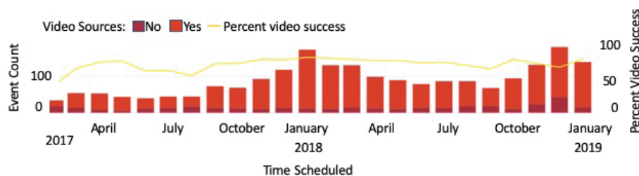
Figure 2—Virtual urgent care visit demand and video connection success by month.

hours to staff a DTC VUC service line and by whom, and how to identify key performance indicators (KPIs).