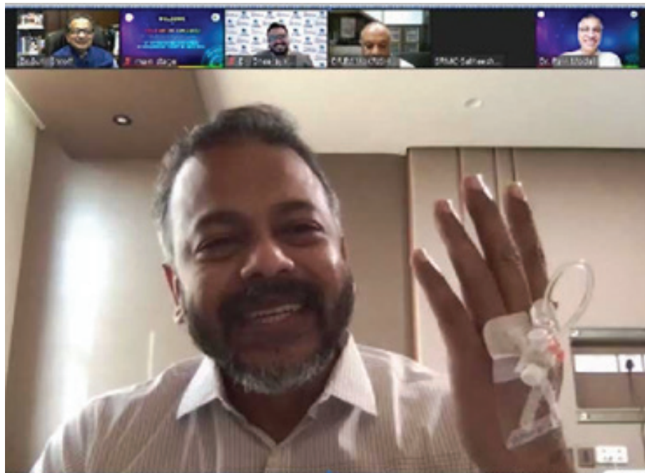
Fig. 2. Hospital CEO afflicted with COVID-19 addressing the conference from the hospital bed.

four speakers suffering from active coronavirus disease 2019 (COVID-19 infections. Several attendees were just recovering or had recovered. One of them spoke from his hospital bed (Fig. 2).