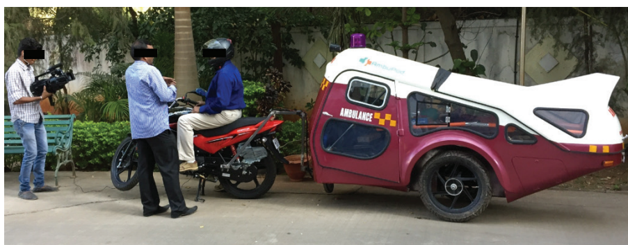
Image 1. A trailer pulled by a motorcycle.

Feedback was sought from the drivers, mock patients and doctors regarding the utility, uniqueness, practicality and affordability of the invention. About 82% appreciated all four parameters; 12% were critical of one or some of the parameters while 6% were neutral. Criticisms were mainly related to the size ('too small'), look ('looks like a coffin') and stability of the vehicle motor-cycle combo.