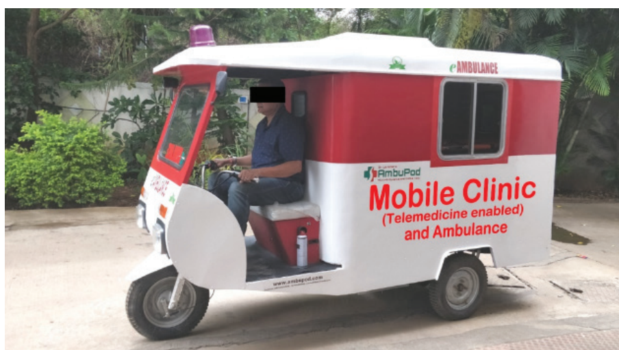
Image 2. A powered electric narrow track 3-wheeler based on a certified eRickshaw chassis.