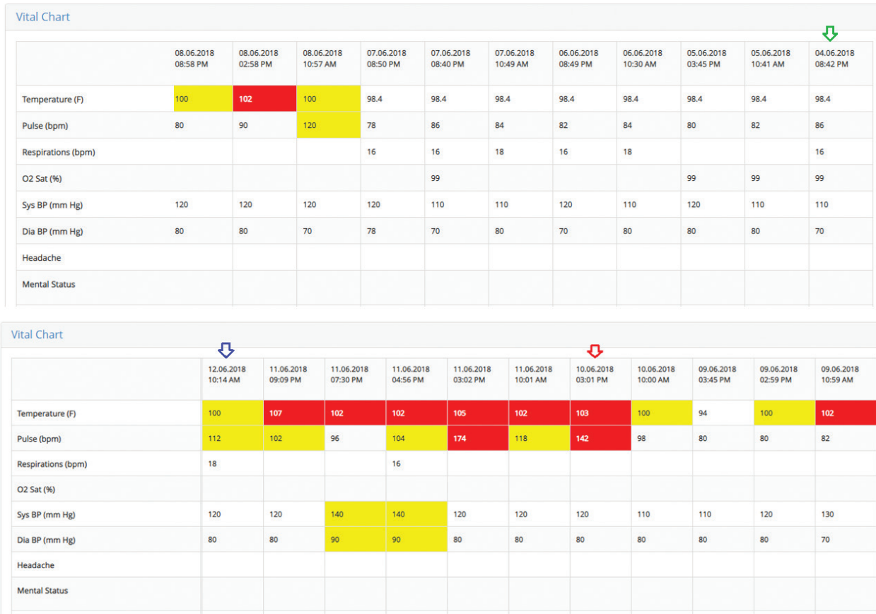
Fig. 5 Case 9. Patient with unexplained fever for several days after a C/S. The green arrow indicates the date of delivery. The red arrow indicates when the patient became restless. The blue arrow represents when she was transferred to a tertiary care hospital.

care center would have received alerts as soon as a set of VS was entered. The physicians from the tertiary care could have contacted the ER at the primary hospital, got the patient stabilized, and could have prevented or safely transferred her directly to tertiary care hospital without the intervening transfer to the GH.