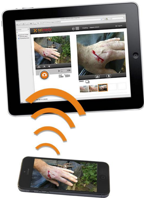
Figure 2. The telmedx mobile video platform allows doctors to watch live streaming video.