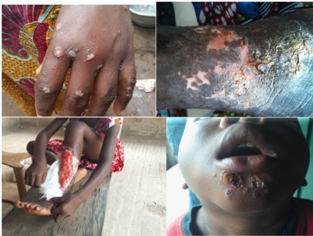
Figure 3. Traveling nurses in Ghana use the telmedx platform to show doctors serious skin conditions that may otherwise go untreated. Shown here are warts from milking goats without protection, a type of flesh-eating bacteria, and two other dermatology conditions that went untreated for many weeks.